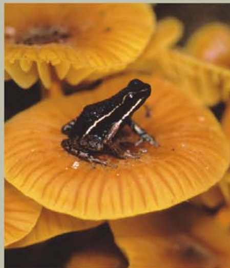
Dendrobatid Frog ( Allobates sp.) (1)