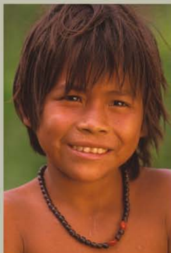
Ese'Eja Indians of Sonene Indigenous Community (1)