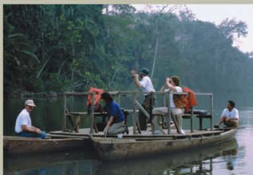
Catamaran on Sandoval Lake