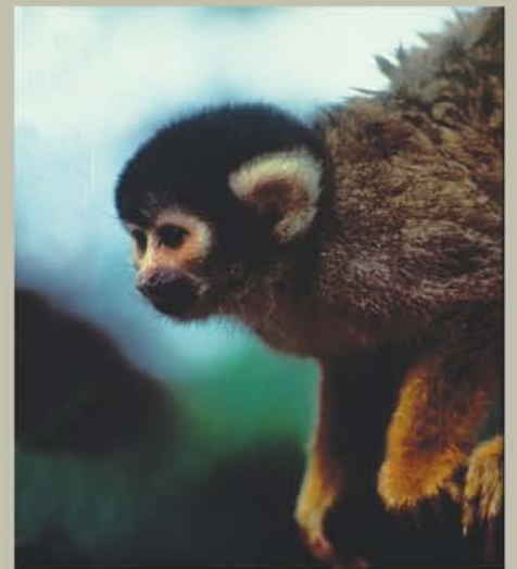
Bolivian Squirrel Monkey (2)