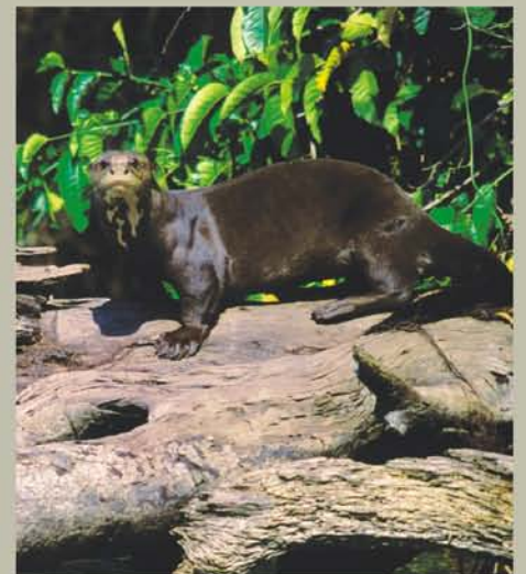
Giant Otter (2)