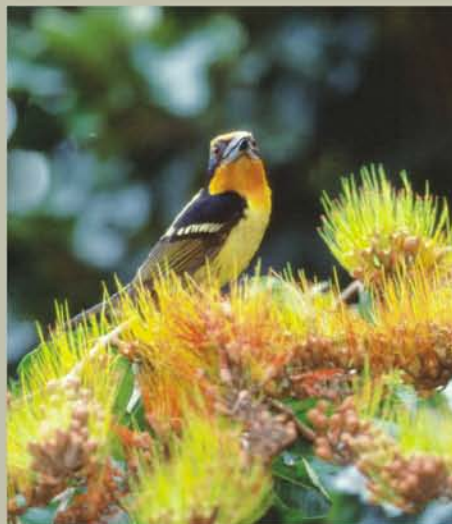
Black-spotted Barbet (1)