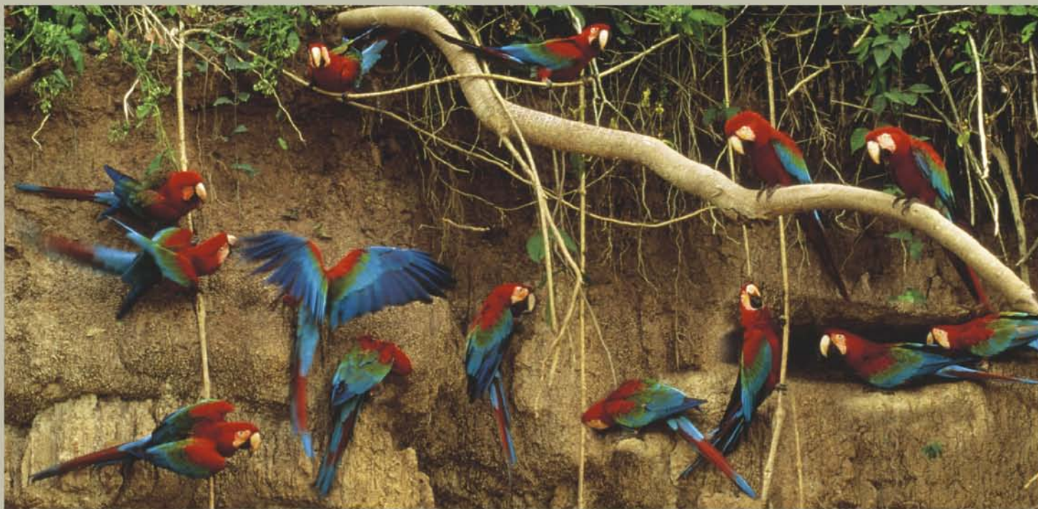
Macaw clay lick