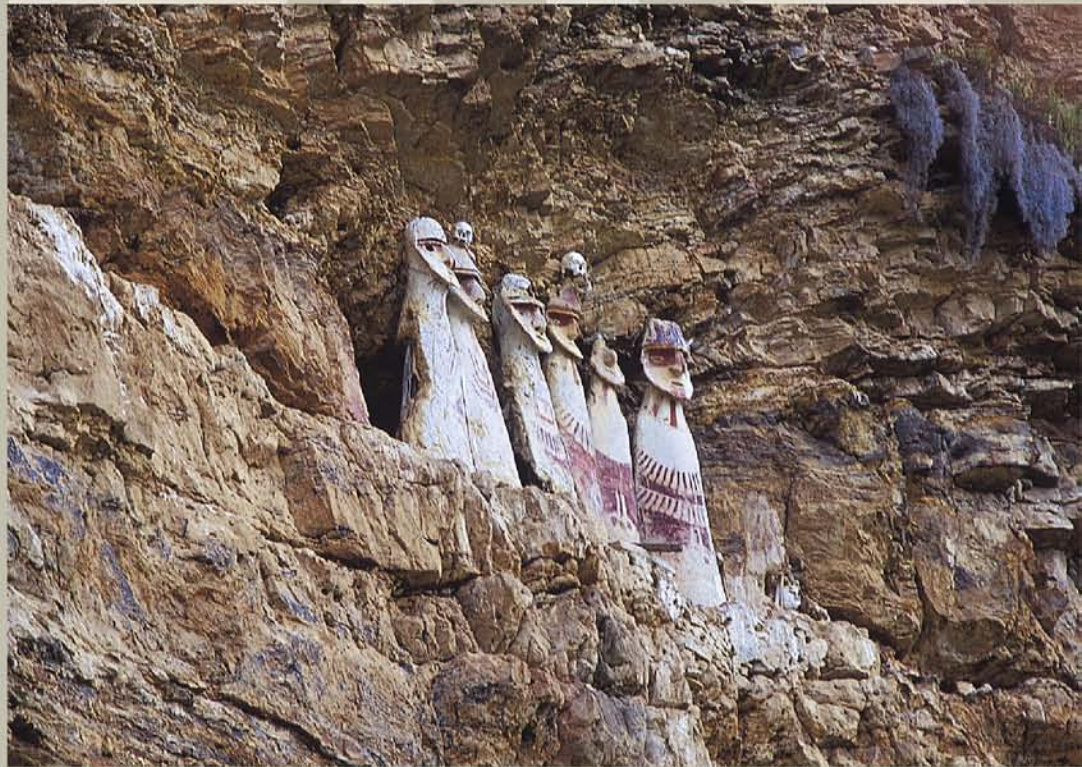
Mysterious sarcophagi at Karajia