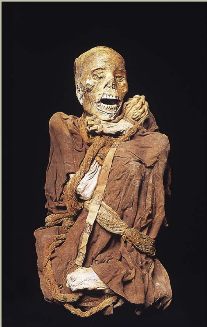
Mummy from Lake of the Condors