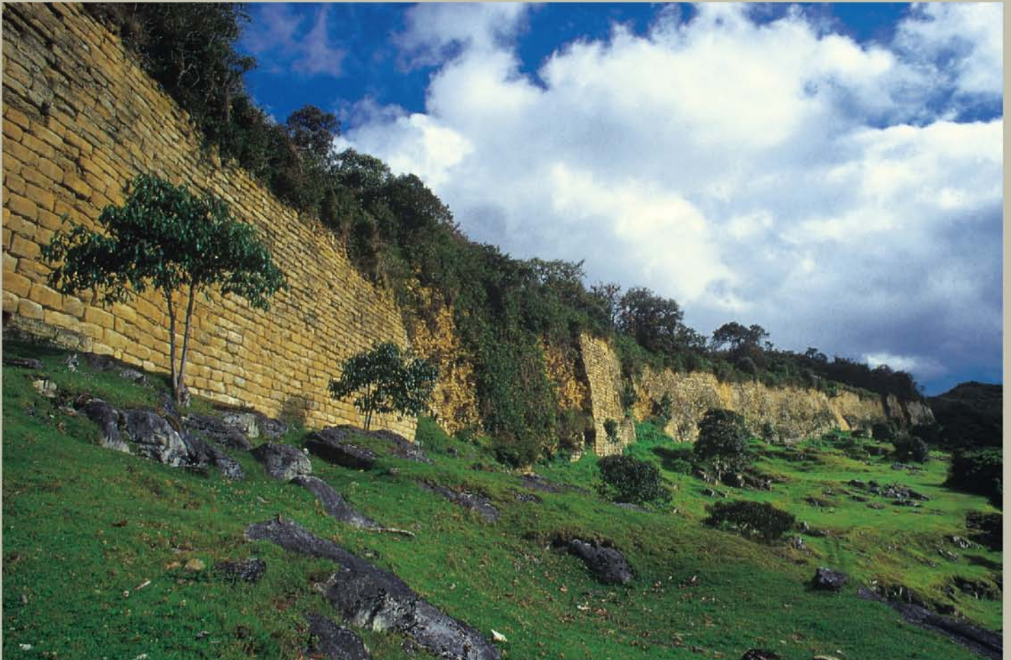
The Wall of the Fortress of Kuelap

Cajamarca is a city of colonial charm, rolling Andean countryside, and home to the important archaeological sites of Ventanillas de Otuzco and Cumbemayo. It is a place of great historical significance - in this city Spanish conquistador Francisco Pizarro captured, imprisoned, ransomed, and executed Inca Emperor Atahualpa, unleashing the destruction of Inca civilization. Travelers may stroll in the town square - site of the first and decisive battle between the Spanish and the Inca - and visit the ransom rooms that were filled with gold and silver by legions of loyal Inca subjects in the attempt to buy the freedom of their doomed regent.