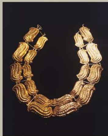
Golden "peanut" necklace from Sipan