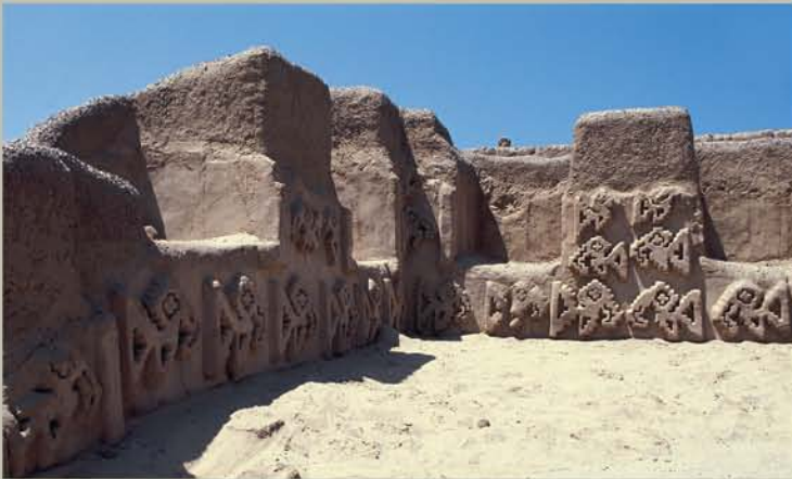
Detail of Chan Chan Palaces