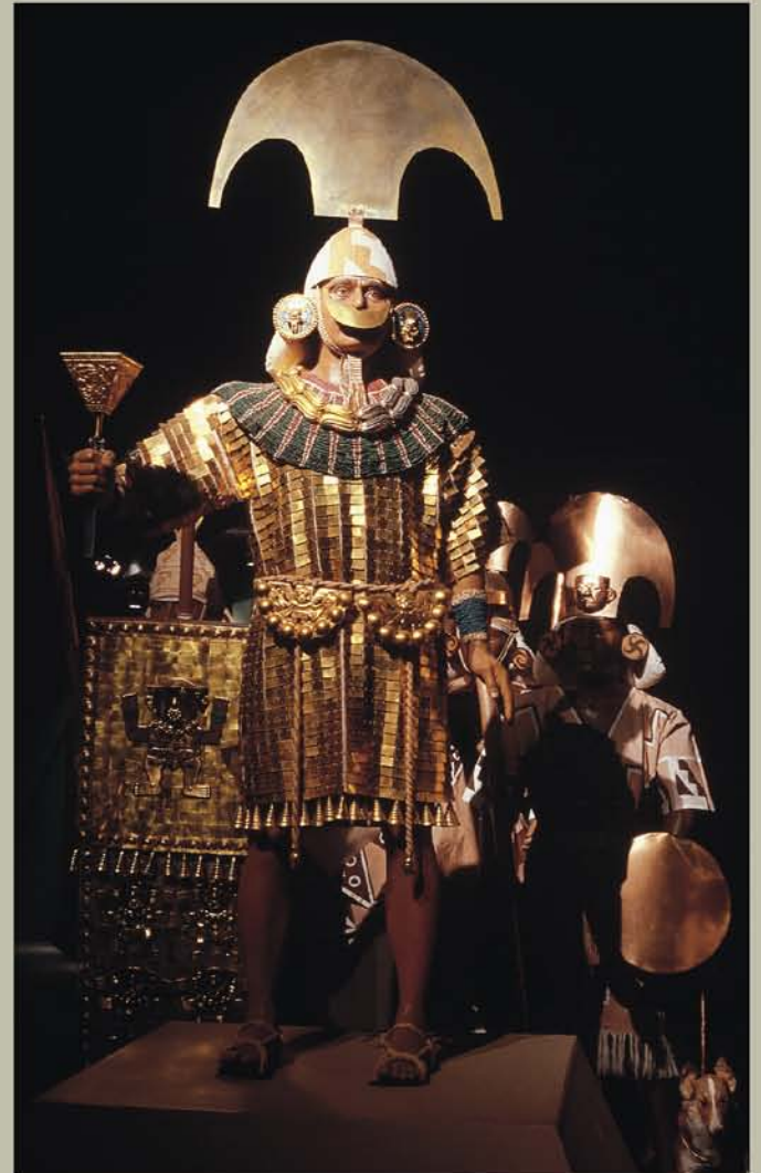
Reconstruction of the Lord of Sipan

The region's shamans, direct descendants of these lost civilizations, are famous throughout Peru for their healing skills and wisdom, and can be visited by travelers. Nature lovers may explore the unique dry forest of Chaparri and the Spectacled Bear reintroduction project. Birdwatchers enjoy spotting the region's 40 unique (endemic) bird species, including the emblematic Marvelous Spatuletail Hummingbird. Travelers may also visit traditional haciendas that breed and show Peru's world famous "Paso Fino" horses.