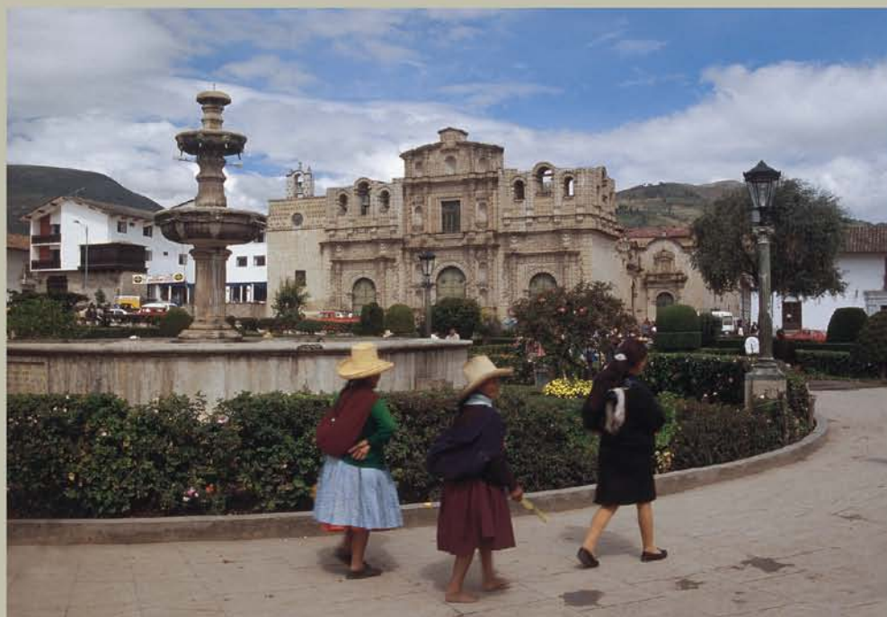
The Main Square of Cajamarca

A program for travelers with a profound interest in archaeology and adventure. We visit the Kuelap Fortress, Revash, the Macro Towers, the Leymebamba Museum, traditional Andean towns, La Congona archaeological site, Ventanillas de Otuzco, and in Cajamarca the Inca Baths and Ransom Room of Atahualpa. Includes half-day treks on foot and on horseback, and all meals and accommodation at the following sites: El Chillo Lodge (4 nights), a rustic hostel in Celendin (1 night), and the Laguna Seca Hotel (1 night). Fixed departures.