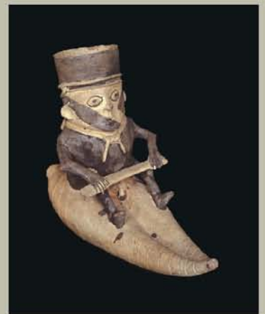
Moche Reed-boat figurine